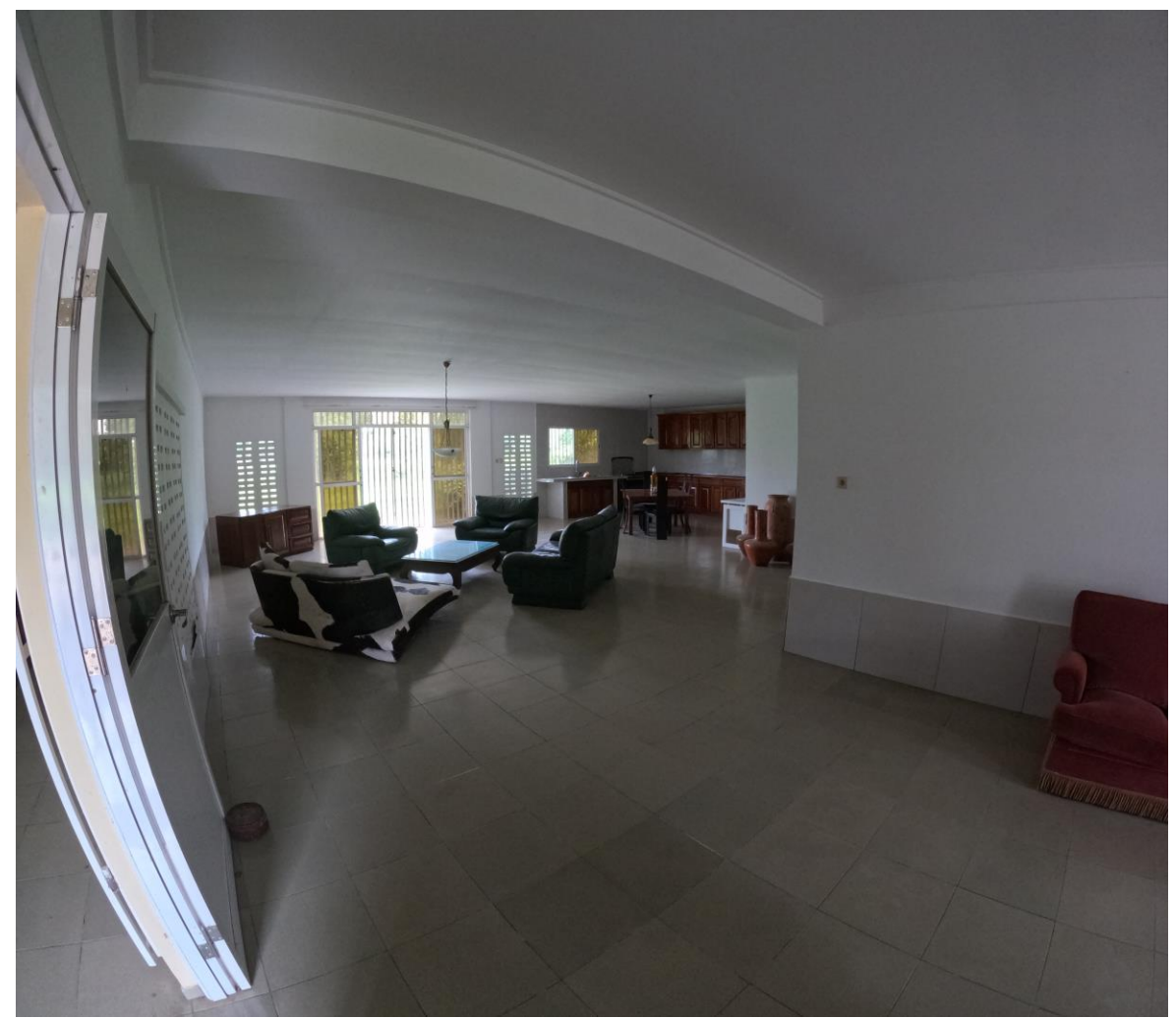
- Living room